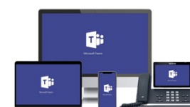
MS Teams Calling Microsoft solution Plugs in your MS Teams

ALL PLANS INCLUDE UNLIMITED CALLS FOR LOCAL, NATIONAL AND CALLS TO MOBILES IN AUSTRALIA