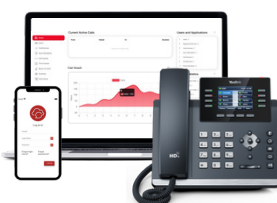
Advanced PBX Softphone Solution Perfect for Flexibility