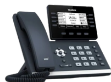
Desktop YEALINK T53W Perfect for general office use