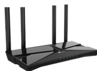
Upgraded modem TP-Link VX230v