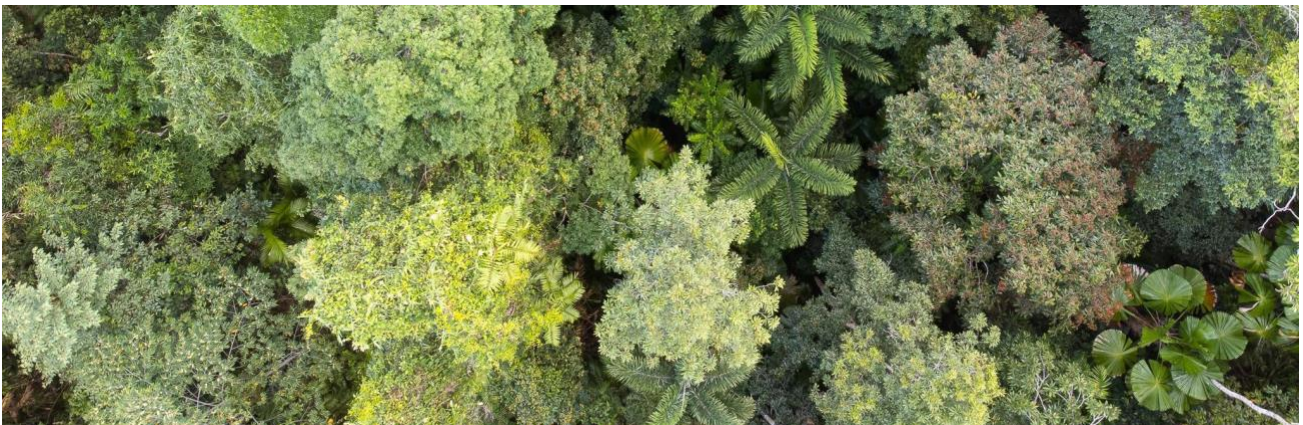
Licuala Rainforest Sanctuary from above

We look forward to continuing our partnership together to Protect Rainforests Forever , well into the future.